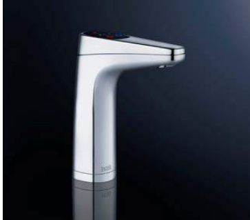
XT Touch in Chrome * To order a touch tap change Product code on page 2 from L to T